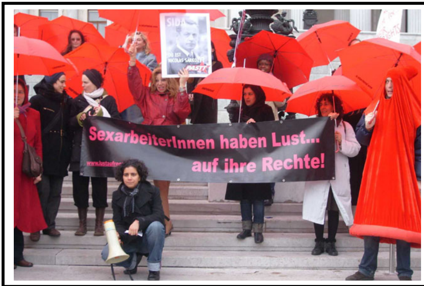
Vienna, March 2008 Advocacy campaign done by the TAMPEP members during the first General Meeting of TAMPEP 8.